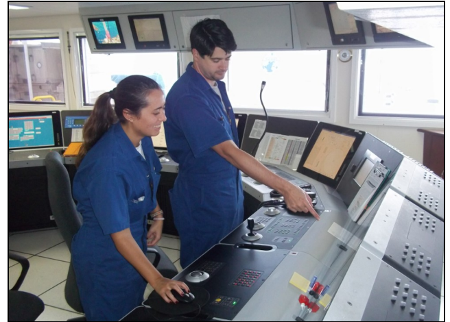
REACH Helped Supervisors to Maximize the Mentorship Program in Place By Coaching them on Effective Communication.